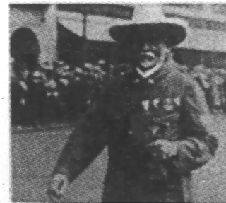
SOCIAL CHRISTIANITY tempered the times. Dan Beard of the Boy Scouts, YMCA'S John Mott, and William Booth, founder of the Salvation Army, brought Christian organizations world attention. Gen. Booth died in 1912.