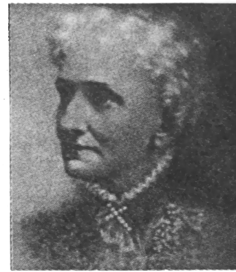
A HALF CENTURY OF CRUSADE ended when Mary Baker Eddy died in 1910. Her doctrine, that health is supplied by applying the preachings and healings of Christ, had spread throughout the world. The mother church was First Church of Christ, Scientist, of Boston.