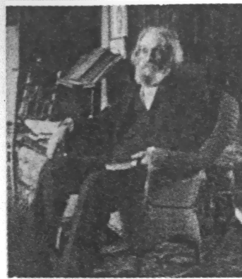
ADVANCE guard of modern literary clergymen, Edward Everett Hale, author of Man Without a Country , died 1909.