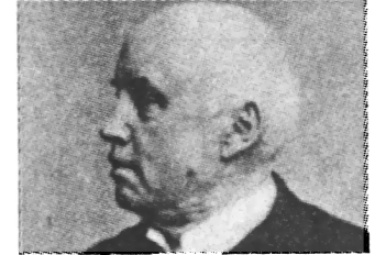
FUNDAMENTALIST, SCIENTIST, ATHEIST engaged in bitter feud. Best selling author and evangelist, "Pastor" Charles Russell (l.) preached against evolution theory of Charles Darwin (c.) and atheism of Robert Ingersoll (r.).